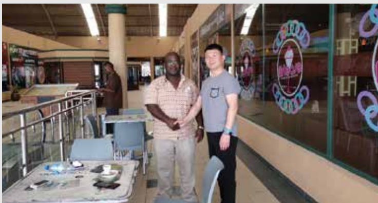
Customer in Tanzania