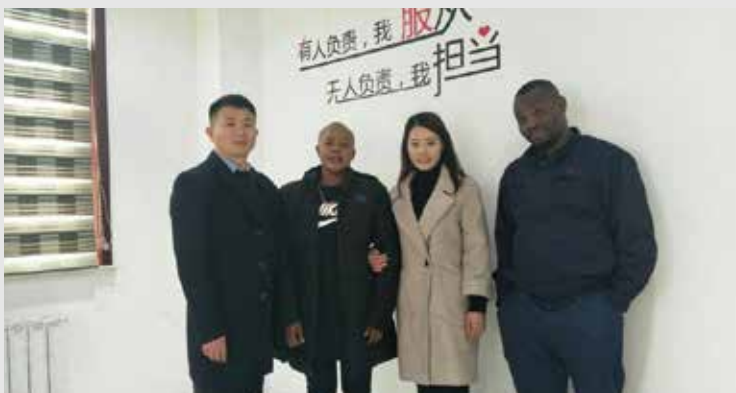
Customer in Zimbabwe