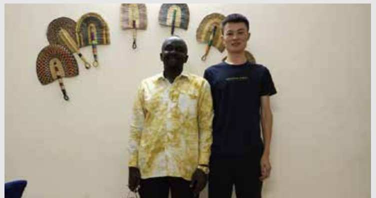
Customer in Burkina Faso