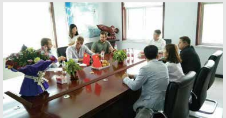
Customer in Russia