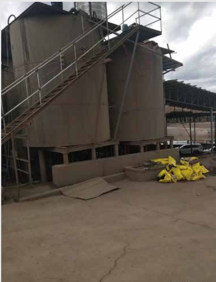
Gold Mine in Yunnan